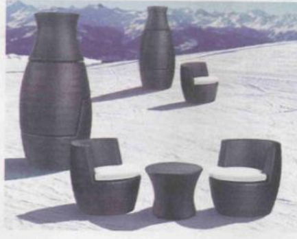
The 'Jackson' table-and-chairs set of outdoor furniture, from Richmond-based 604Wholesale.ca , stacks into a slim unit for easy post-summer storage.